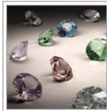
Expanded Russian diamond sanctions expected within