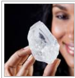
Diamond mining CEO calls for further sanctions on Russia