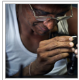
Struggling to make ends meet: India's diamond workforce