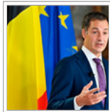
Belgium PM demands widespread support of Russian diamond