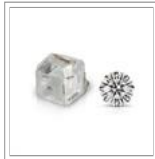
Campaign success for lab-created diamond supporters