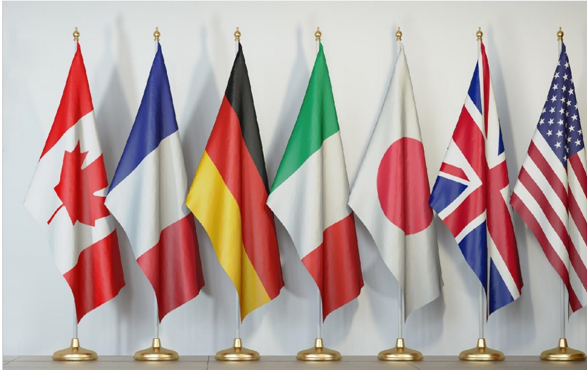
"We will introduce import restrictions on non-industrial diamonds, mined, processed, or produced in Russia by 1 January 2024, followed by further phased restrictions on the import of Russian diamonds processed in third countries," the statement reads.