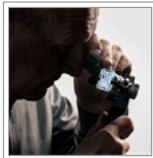
Major diamond producer cancels scheduled sales