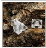
Russian diamond sanctions: Latest details revealed