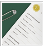
Global ambition: Diamond certification company tackling