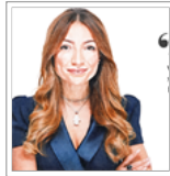
Value from virtue: Be the change you wish to see in the world