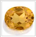
Rare Aussie sapphire heads to auction