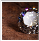
Online auctions cancelled by world's largest diamond