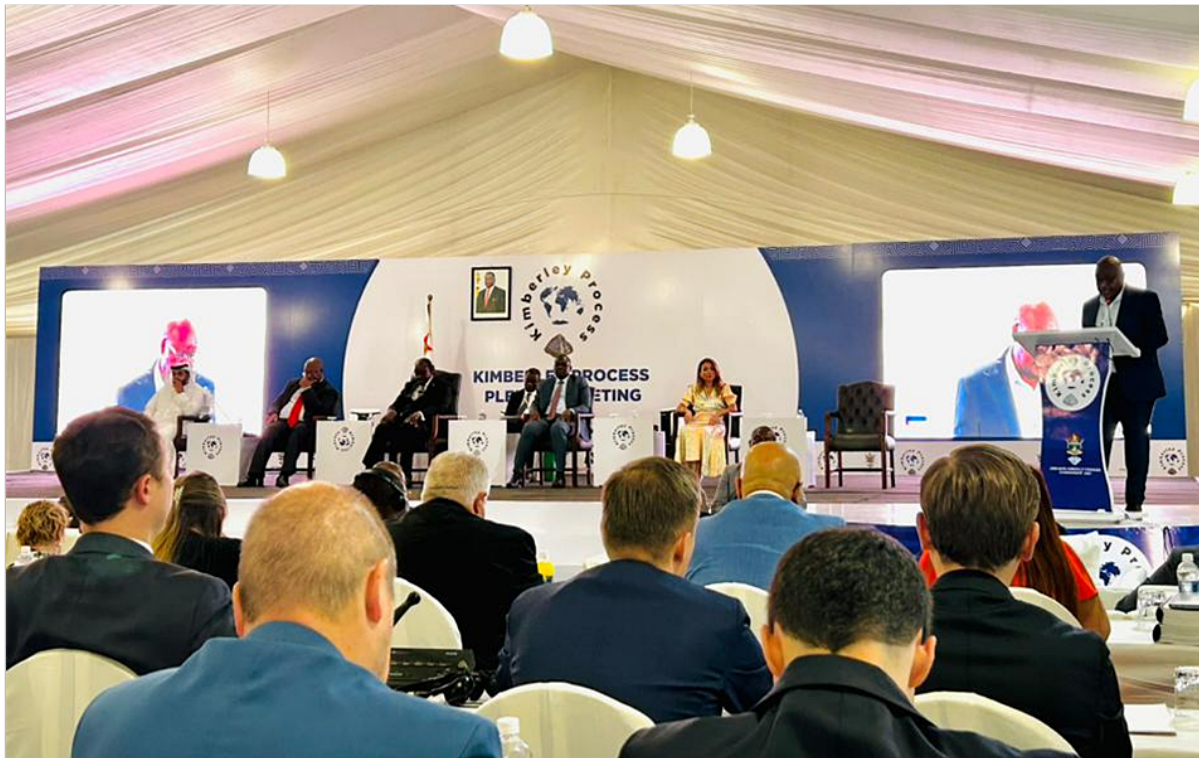
The Kimberley Process plenary meeting in Zimbabwe has reached a bitter ending after concluding with a deadlock over the definition of 'conflict diamonds'.