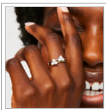
Controversial lab-created diamond pricing strategy