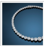
Stunning diamond necklace leads auction in Hong Kong