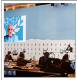
Russia accuses Western powers of compromising