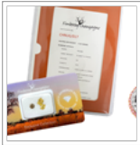
Gold & opals: Ellendale Diamonds celebrates new